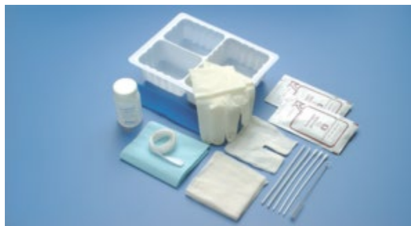
Tracheostomy Care Tray

FOR IMMEDIATE RELEASE: December 19, 2023